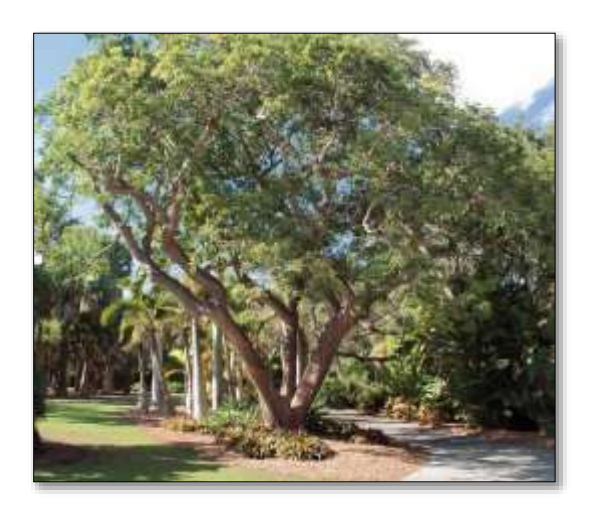
Geiger Tree (flowering tree)